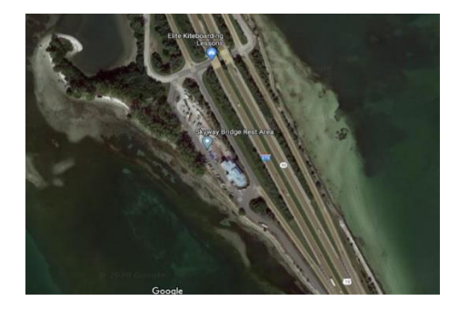
Figure 2 North natural site

The study was conducted off the Bob Graham Sunshine Skyway Bridge South Rest Stop (Figure 1) and the Bob Graham Sunshine Skyway Bridge North Rest Stop (Figure 2) located in St.Petersburg, Florida, United States. Three sites were surveyed; two sites were located on the South Skyway Rest Stop, and one site on the North Skyway Rest Stop. The southern natural site was located at 27°35'1.62"N and 82°36'59.08"W. The southern mitigated site was located at 27°34'58.37 N and 82°36'51.04"W. The two southern seagrass beds were located within one quarter kilometer of one another, separated only by a man-made breakwater wall and sandbar. The northern natural site was located at 26°38'11.2" N and 82°40' 4.9" W